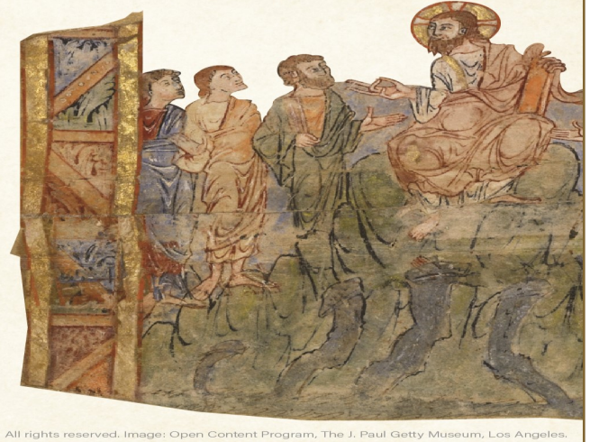
© J. S. Paluch Co., Inc. - Excerpts from the Lectionary for Mass © 2008, 1998, 1997, 1986, 1970, CCD. All rights reserved.

TWENTY-EIGHTH SUNDAY IN ORDINARY TIME OCTOBER 10, 2021